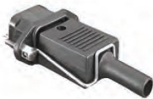
Retainer clip (included)