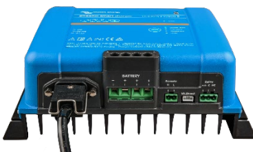
Phoenix Smart 12/50(3)