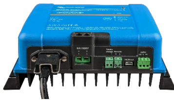
Phoenix Smart 12/50(1+1)