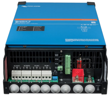
Connection Area Quattro-II 48/5k